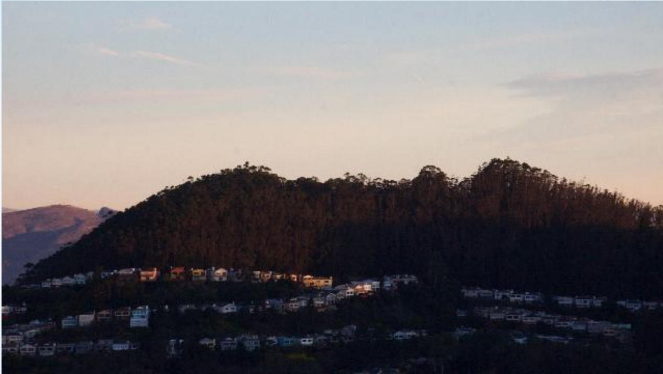
Mt Sutro at sunrise